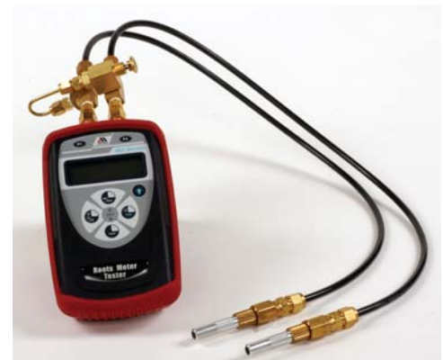
The Meriam Smart Manometer™ Handheld, All-Electronic d/p Tester

It has been found over decades of experience that differential testing is an effective method of detecting changes in meter condition. At present, the most effective differential comparison appears to be directly with the initial field data, although factory supplied characteristic data may also be used. Other progress in differential testing is expected as better testing standards are developed and the benefits of experience realized.