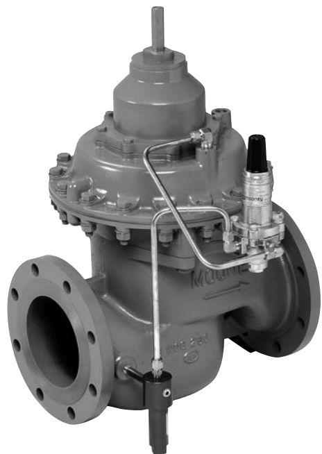
6" FlowMax® Low Differential Regulator with Series 20 Pilot and Type 30 Filter