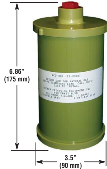
Figure 2 - Becker Model ACD-300 Activated Charcoal Deodorizer

The ACD-300 easily installs on the vent exhaust port of nearly any natural gas control instrumentation to eliminate the odorant from atmospheric bleed gas.