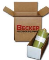
Figure 3 - Becker Model ACD-300 Activated Charcoal Deodorizer 4-Pack

The ACD-300 easily installs on the vent exhaust port of nearly any natural gas control instrumentation to eliminate the odorant from atmospheric bleed gas.