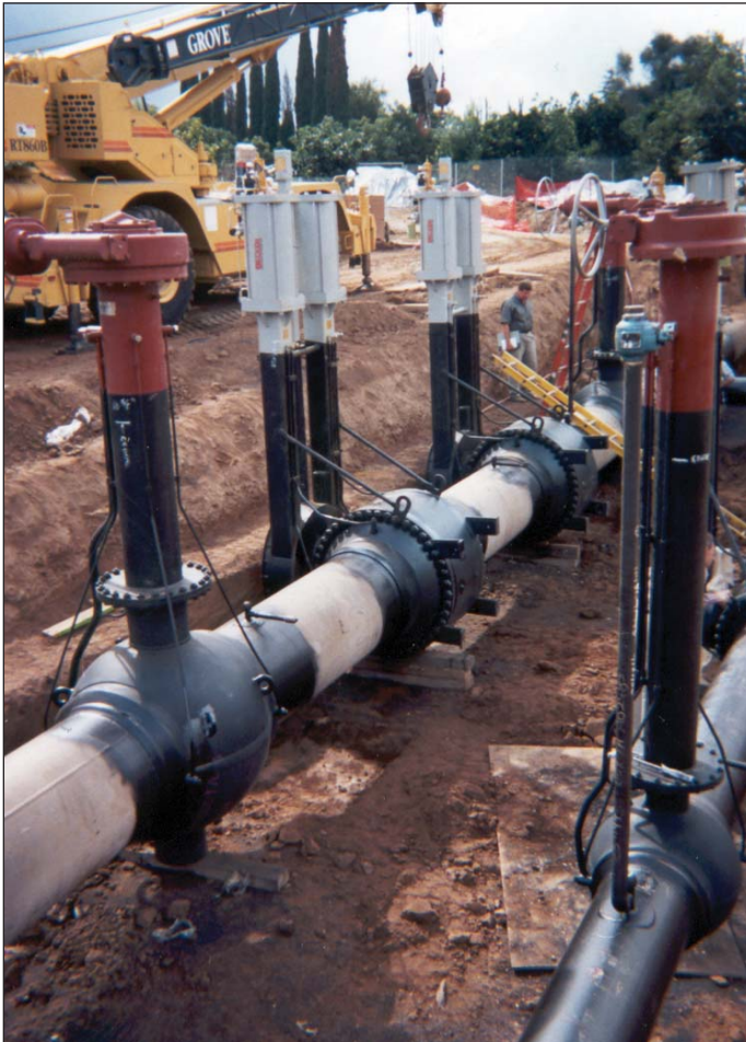
Figure 1 - Installation of Becker Below Ground Ball Valve Regulator.

Below Ground Ball Valve Regulators are Designed for Large Volume Regulator Stations Requiring Reduced Noise Levels