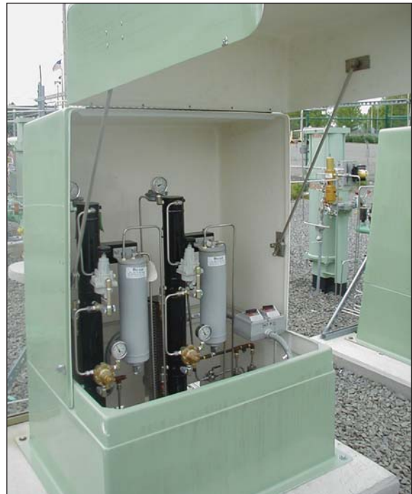
Figure 4 - Below Ground Regulator with Fiberglass Cabinet.

Station one originally incorporated 4" above ground regulators with a flow of 2.4 MMscfh and 157 psi outlet pressure. The noise level on station one was measured at 106 dBA for the above ground regulators. During major station revision, 8" valve regulators were installed below ground and sound readings were taken with a flow of 2.9 MMscfh. The newer sound level readings registered at 77 dBA, which was reduction of 29 dBA. Sound level calculations predicted a sound level of 86 dBA, which ultimately proved to be very conservative.